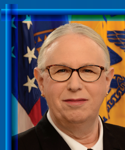
"Gendering Identity and Health" Admiral Rachel Levine, MD (she/her) Assistant Secretary for Health, U.S. Dept. of Health and Human Services